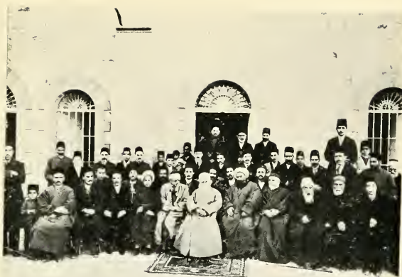
ABDUL BAHÁ WITH A GROUP OF BAHÁIS AT THE TOMB OF THE Báb